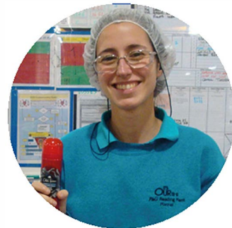
Alumnus of Pembroke College