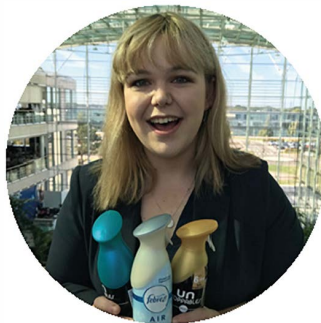
Alumnus of Robinson College