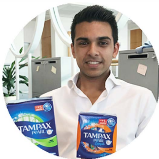
Alumnus of Emmanuel College